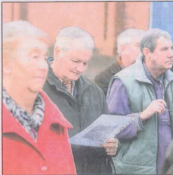
MEMORIES: A small crowd watched as the blue plaques were unveiled commemorating Grout's and the old naval hospital.