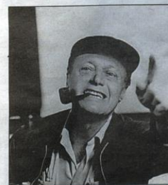
LEGEND: Cinematographer Jack Cardiff on location on one of his films. Throughout his career he won two Oscars.

■ For more information about the festival, and for a full programme, visit www.greatyarmouthartsfestival.co.uk